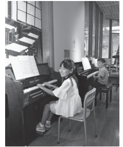
Information Bulletin HAMAMATSU September 2024 Cover

*This bulletin contains selected information from the Japanese edition published by City Hall. *The telephone numbers listed in this bulletin will all be answered in Japanese only.